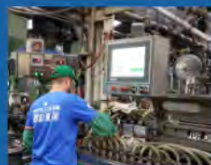
POLYMER PROCESS TECHNICIAN